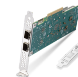
Intel E810-DA2 10/25GbE SFP28 2-Port PCIe Ethernet Adapter