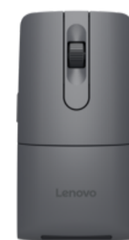
ThinkPad Bluetooth Presenter Mouse (Aura Edition)