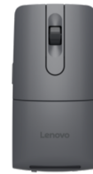
ThinkPad Bluetooth Presenter Mouse (Aura Edition)