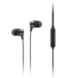
Lenovo Analog In-Ear Headphones Gen II Bulk Package (20pcs)