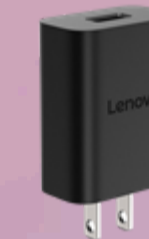
Lenovo 20W USB-A Wall Charger ZG38C07841

Please click here to view the full list of accessories.