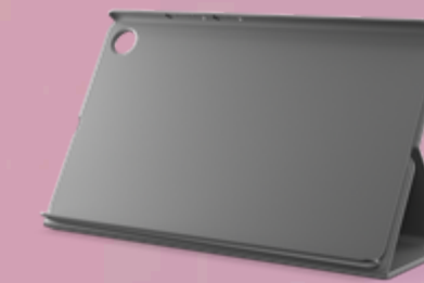
Lenovo Folio Case for Lenovo Tab One ZG38C06914